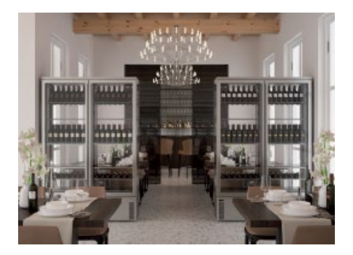
DECANTER Model 8980210 in Black finish